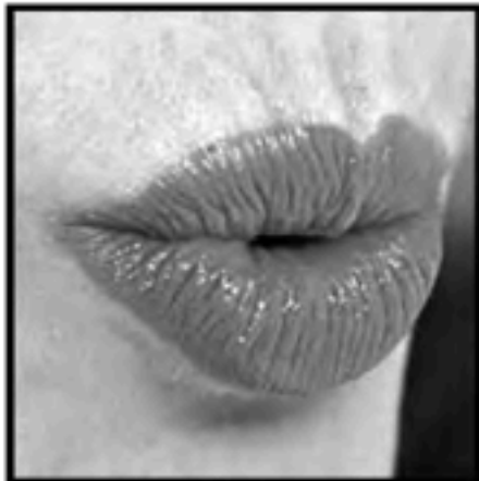
c) Pinched lip corners