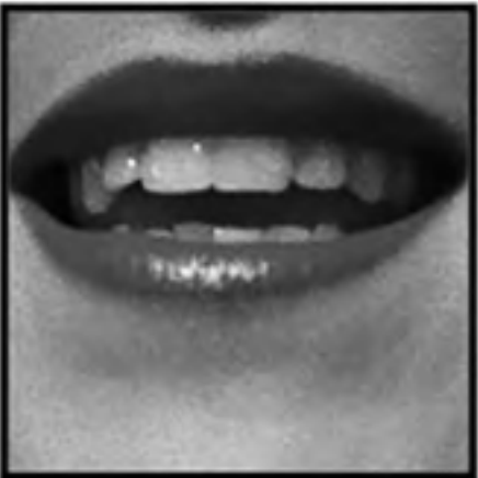
c) Speaker's [i]