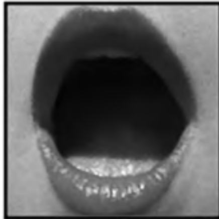
b) Singer's [a]