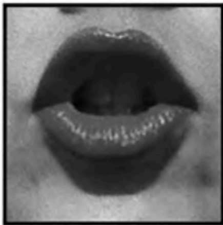
a) Outward curled lips