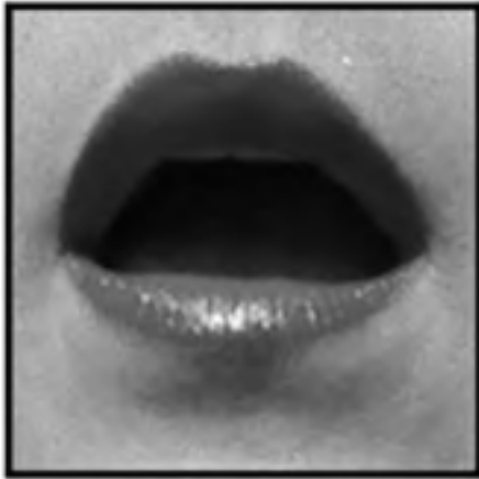
a) Speaker's [a]