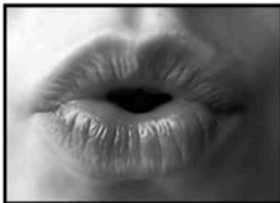
e) Correct formation