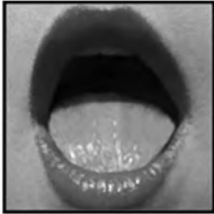
d) Singer's [i]