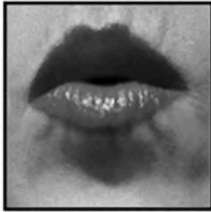
b) Tensely rounded lips