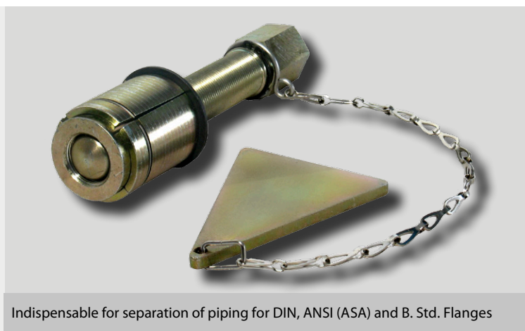
Indispensable for separation of piping for DIN, ANSI (ASA) and B. Std. Flanges