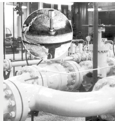
DBP Nr. 2522817 • US Patent No. 4015324