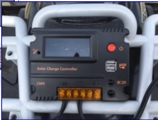
Powerfilm 21w rollable panel