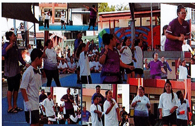
Beatz of Mangere

Yesterday, JBS students were treated to an amazing show, performed by the Auckland Theatre Company. "Mythmakers" shows are short, high-quality plays inspired by the traditional stories and legends of Aotearoa, the Pacific (and the world).