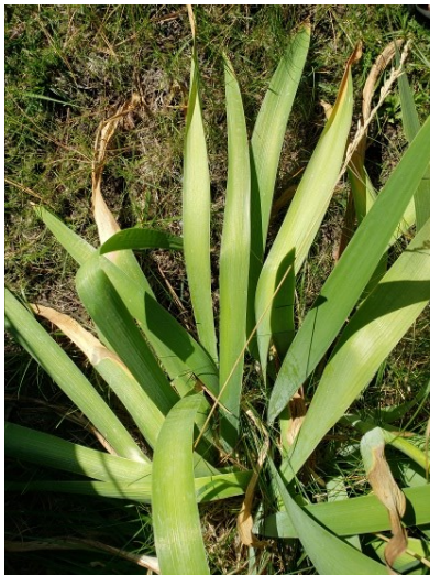
Iris leaves are excellent fresh or dried.