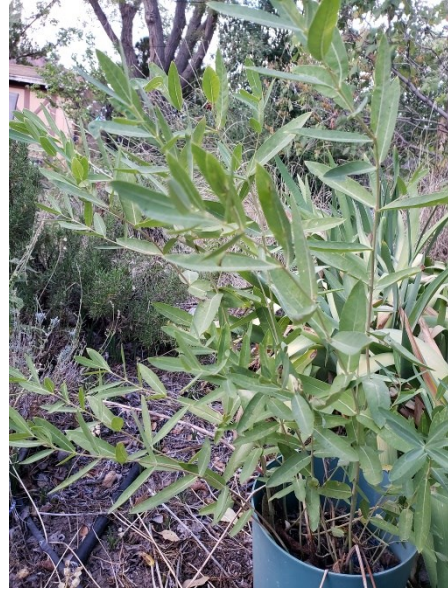
Dogbane ( Apocynum cannabinum ) looks a lot like small willows at this time of year. Found along ranch ditches. You can gather last years stalks.