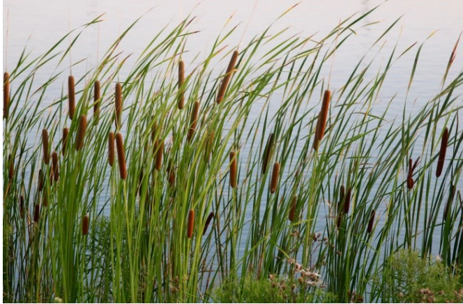
Cattail leaves are perfect, fresh or dried.