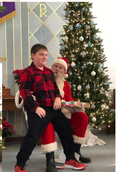
More Santa pictures!