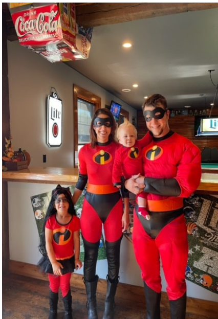
The Schaefers celebrating Halloween in style!