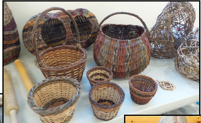
Margaret's Willow baskets