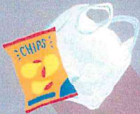
Stretchy or Crinkly Plastics