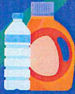
Rigid Plastic 1-7