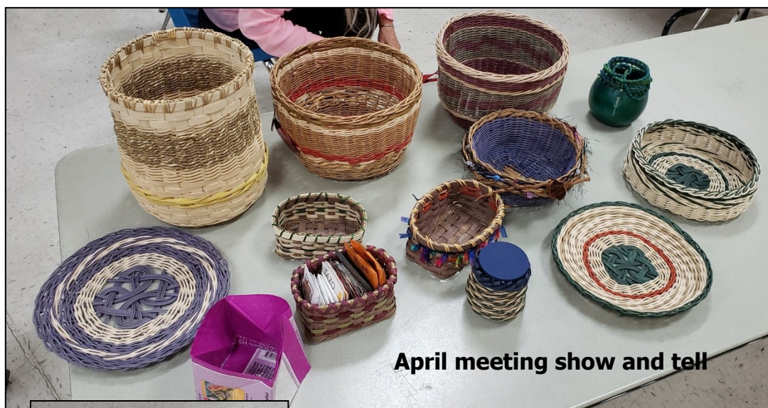
April meeting show and tell