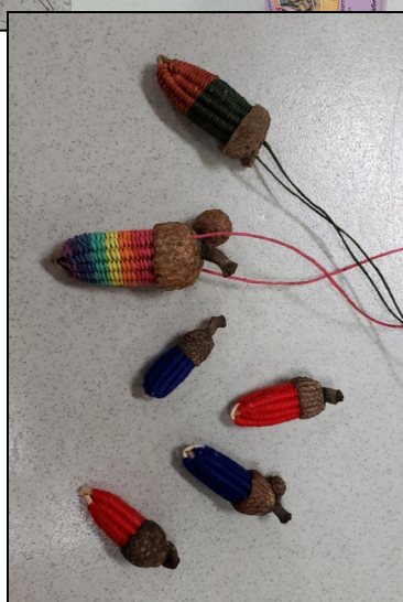
Peggy Camp's amazing miniatures