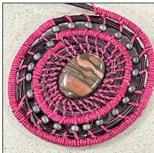
Susan Lester's pine needle pendant program