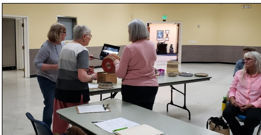
Challenges of show and tell for our Zoom