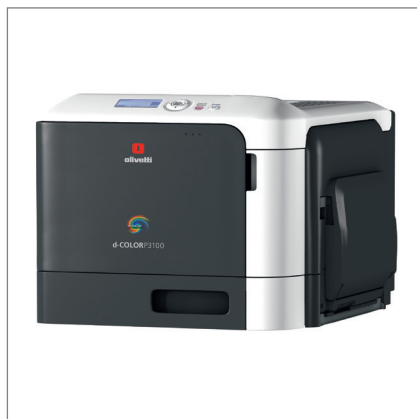
Professional A4 colour printer with stylish design