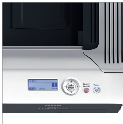
4-line LCD operator panel