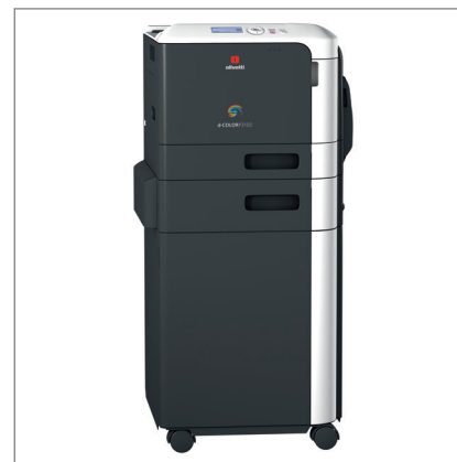
3 input paper trays (optional)