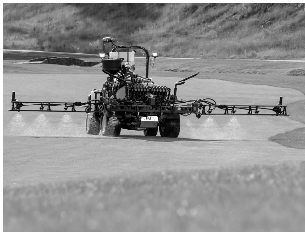
GeoLink's individual nozzle control saves time and money.

RTK: Real Time Kinematic (RTK) satellite correction is a technique used to enhance the precision of position data derived from satellite-based positioning systems, being usable in conjunction with all positioning platforms.