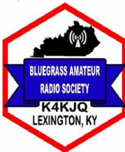
Proposed new Logo