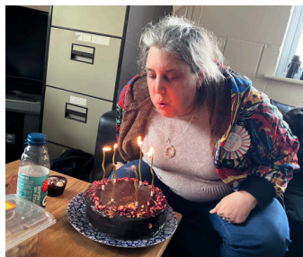
Storm Phinea extinguishing a fire in the clubhouse!

The unwanted addition of Storm Kathleen meant that the on-water plans for SAC's annual primrosepaddle had to be curtailed somewhat. Not to be put off by a little wind the hardy youngsters ventured out in a variety of craft for a rather blustery paddle before heading back to the clubhouse for cake and chocolate and to celebrate a certain ladies Birthday.