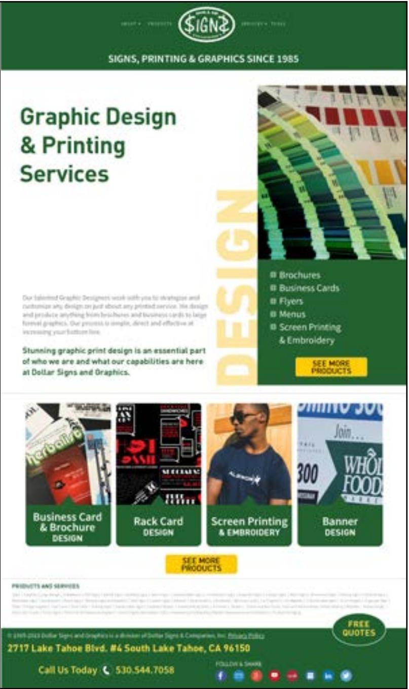
DOLLAR SIGNS AND GRAPHICS Web Design sub page