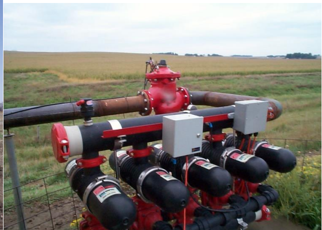
Automatic filtration systems

Hook's Point Irrigation – from design to finished system – 1-800-438-2452