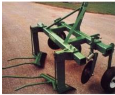
Challenger 1800 Mulch Lifter