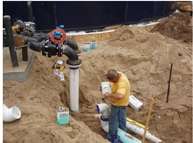
Buried PVC water main, connection