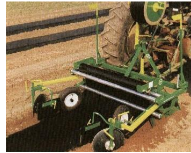
Mulch layer w/drip attachment