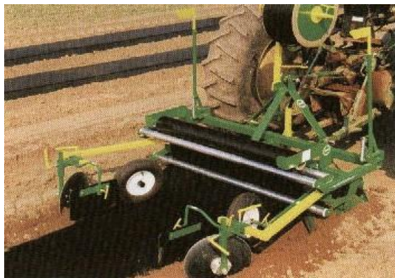
Rain Flo Mulch layer