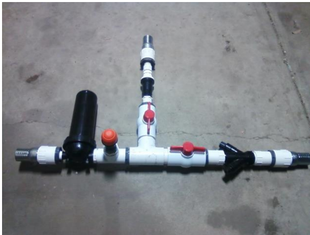
PVC manifold, 2 zones