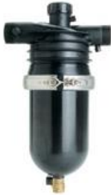
2" Super Filter