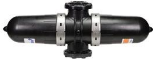
6" Twin Filter