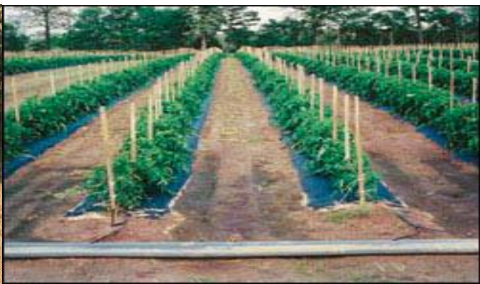
Field of Staked tomatoes on plastic with drip irrigation