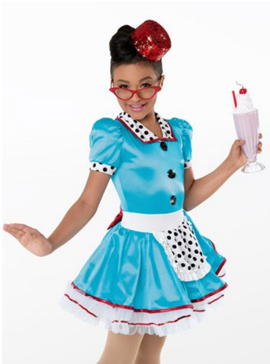
“L.A. Boyz” – Jazz