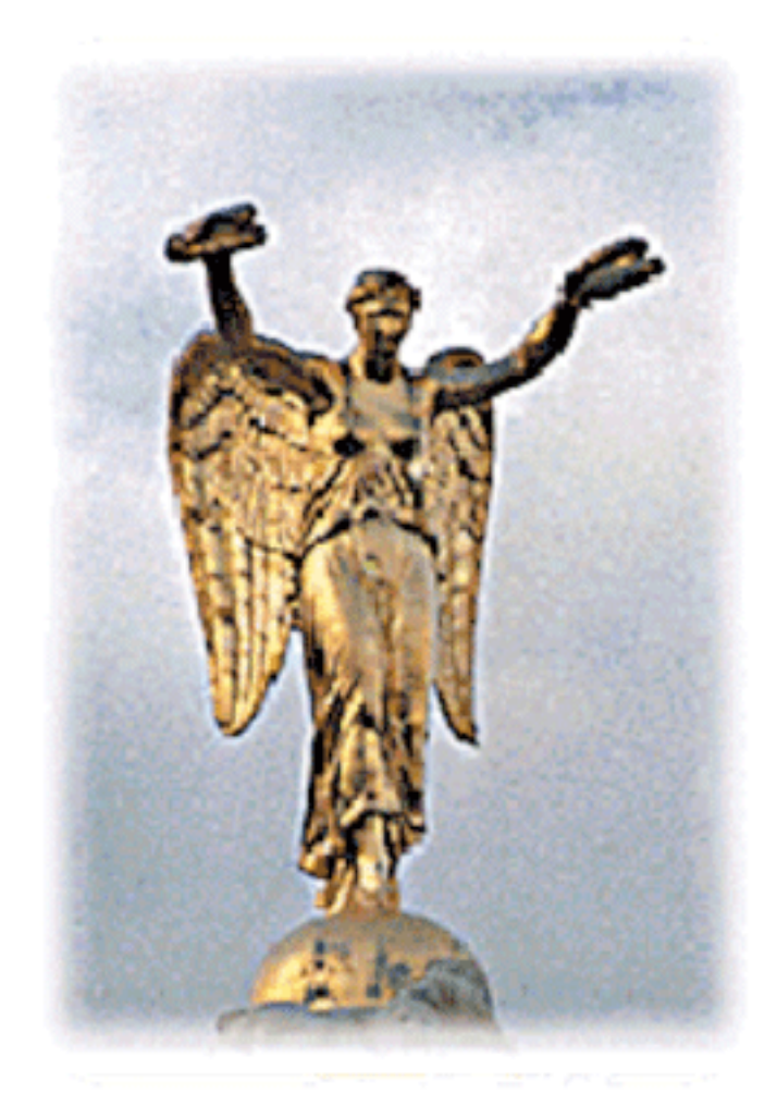
the third angel