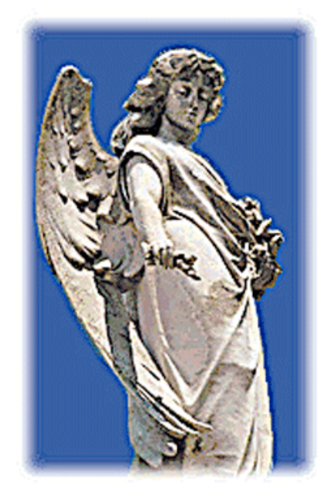
the fourth angel