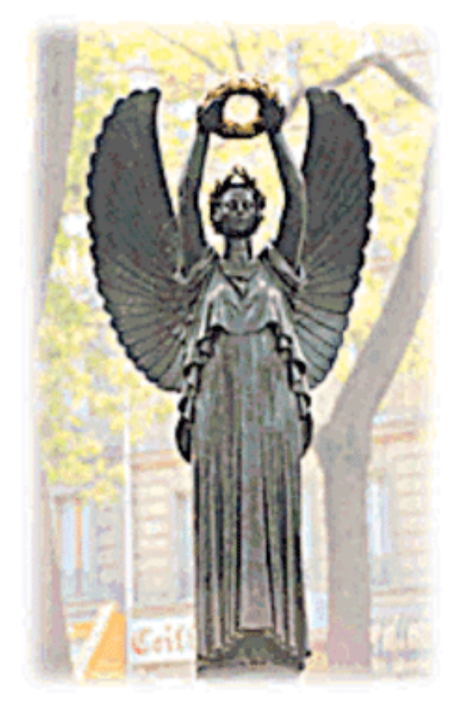
the second angel