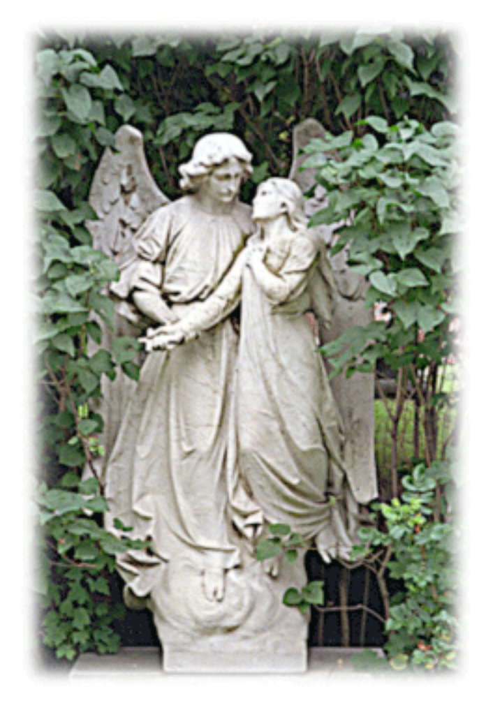
the first angel