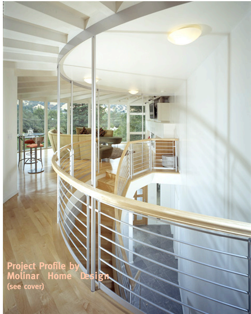
Project Profile by Molinar Home Design (see cover)

Kerwin Says: Once the distance to a property line or imaginary is 30 feet or more, there is no wall or opening protection required. Also note that for area increase under Section 506 for frontage, there is no imaginary line and the distance may be taken to the face of the adjacent building on the same property. Also note that for area increase under Section 506 for frontage, there is no imaginary line and the distance may be taken to the face of the adjacent building on the same property. ☺