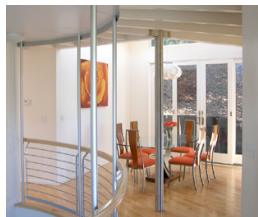
Project Profile by Molinar Home Design (see cover)