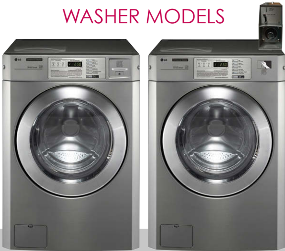
GCWP1069CS2 – Card-Operated Washer