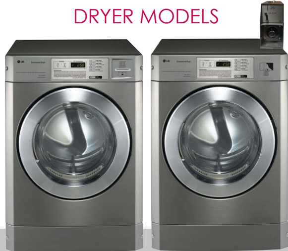
GD1329CGS2 – Card-Operated Dryer (gas)