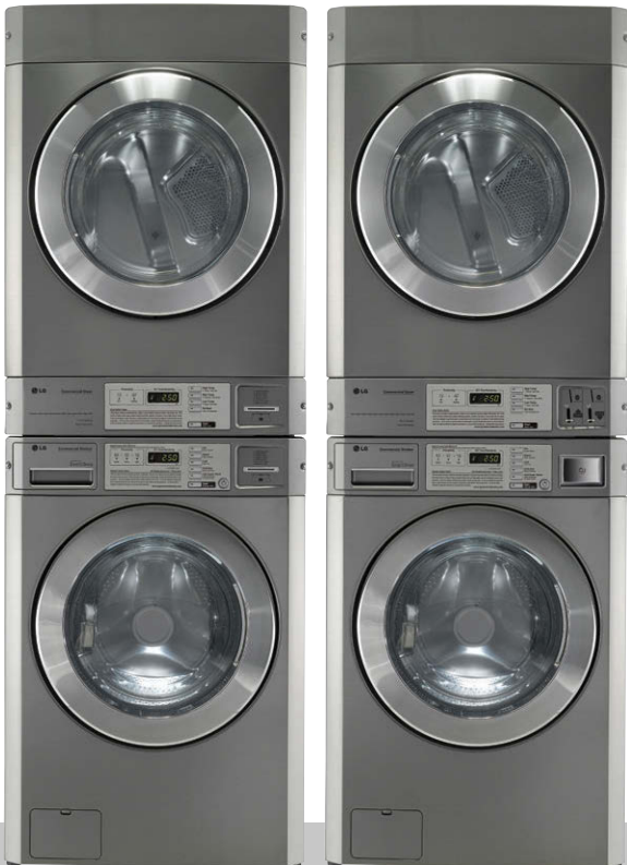
GCWP1069CD2 – Card-Operated Washer, Lower Stack