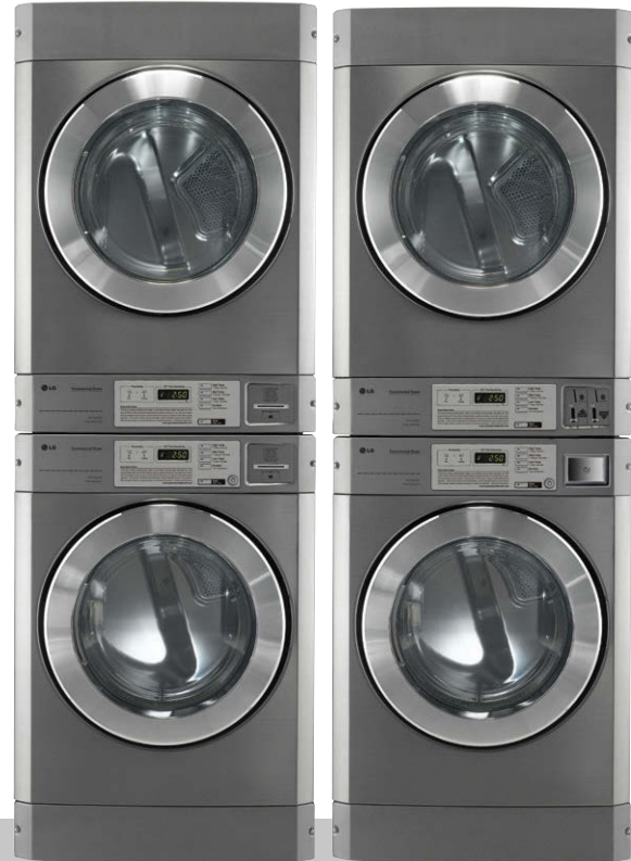
GD1329CGD2 – Card-Operated Dryer (gas), Lower Stack