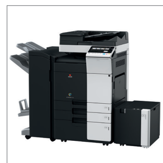
Configuration with FS-534SD Finisher, PC-410 Tray, LU-302 Large Capacity Tray, and DF-704 Document Feeder

On the operator panel there is a special area allowing connection with NFC (Near Field Communication) technology devices for authenticating users or using Bluetooth (optional).