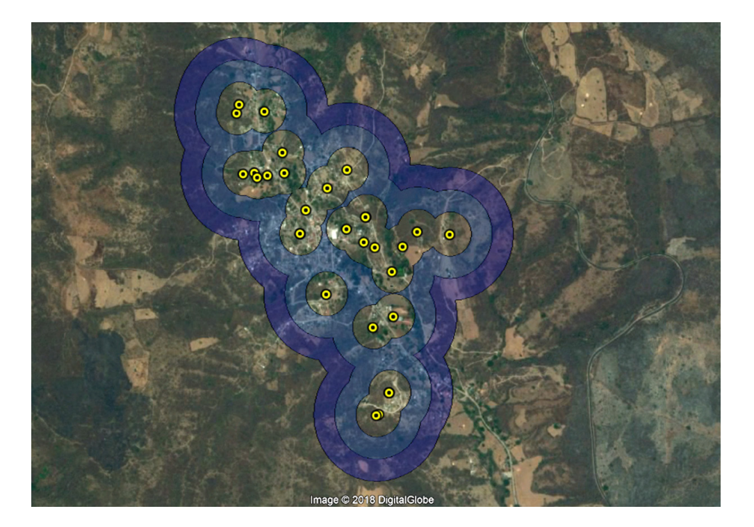
Figure 3. Pig movement radiuses in a Mexican location. Each circle represents a 100-m radius with respect to the site of households where pigs are reared. Located by GPS.

available or because open air defecation occurs during agricultural production activities. In any case, this favors the life cycle of parasites like T. solium .