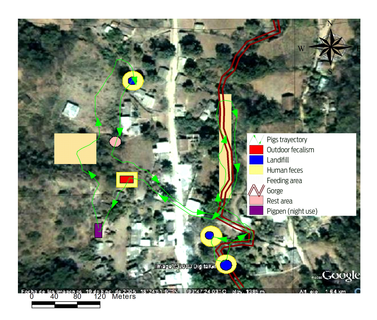
Figure 1. Trajectory of a group of pigs in places where they can rest and consume fecal matter. San Martín Pachivia, Guerrero, Mexico.