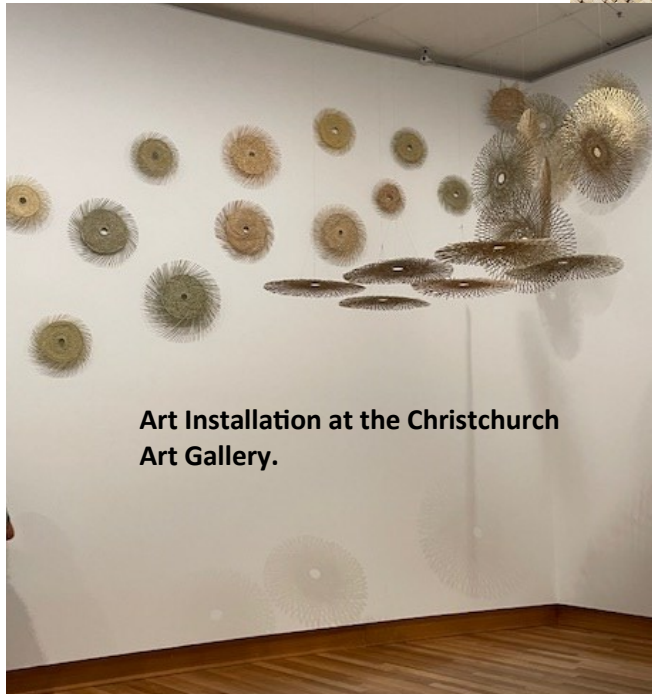
Art Installation at the Christchurch Art Gallery.