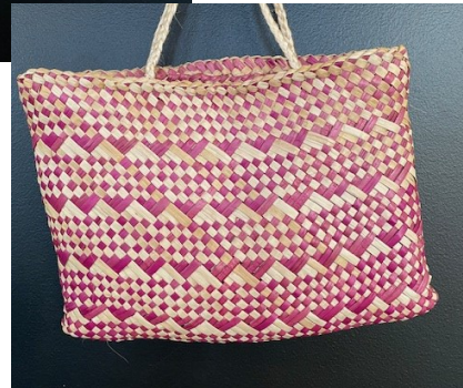
Harakeke (Phormium tenax) - New Zealand Flax. Freshly split and woven