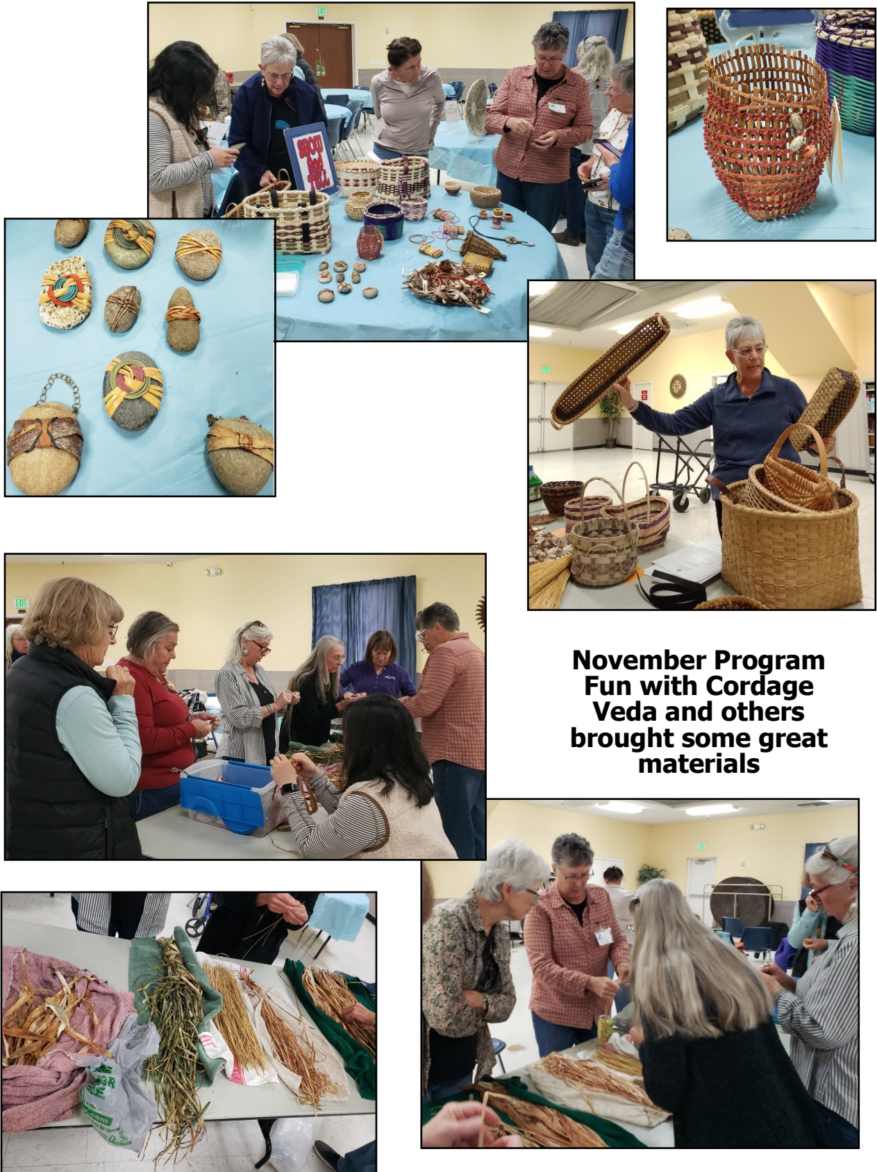
November Program Fun with Cordage Veda and others brought some great materials