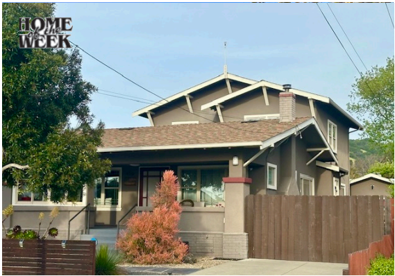
456 Mitchell Ave • San Leandro • Priced at $1,249,000

This GORGEOUS Craftsman blends charm and modern upgrades with 4 spacious bedrooms plus an office/5th bedroom, 3.25 baths, and nearly 2,900 sq ft of living space. The luxurious primary suite offers a sitting area, large closets, and a walk-in shower. Enjoy a chef's kitchen featuring a Viking stove, center island, concrete counters, and ample cabinet space. The formal dining room features classic built-ins, while the large front porch invites relaxation. With parking for 5-6 vehicles, an electric driveway gate, and a newer roof, this home is special and you should not miss your opportunity to own such a beautiful home.