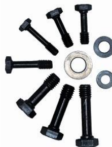
Part Number: UB300 $1,730.00

36 ea. 1/2" Bolts with washers (12 ea. of lengths 1-1/2", 1-3/4" and 2")