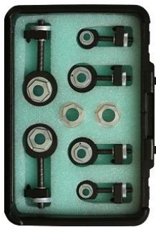
Part Number: AT-1104 $ 800.00

Kit includes the following actuator socket sizes: (for in between sizes, use the next size up)