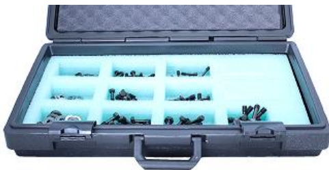
Part Number: UB200 $1,070.00

Posi Lock's undercut bolt sets virtually eliminate the problem of 'bolt-binding'. This innovative precision undercut bolt and washer system helps you achieve and maintain perfect alignment faster and easier than ever before. The sets feature hardened, grade-8 bolts with maximum clearance and through-hardened, plated washers. Kits include carrying case. Individual components also available.