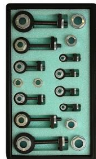
Part Number: AT-1108 $ 1,360.00

Same as AT-1104 plus the following additional actuator socket sizes: (for in between sizes, use the next size up)