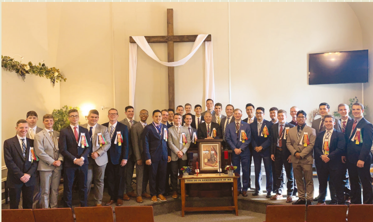
2023 Evangelistic Team