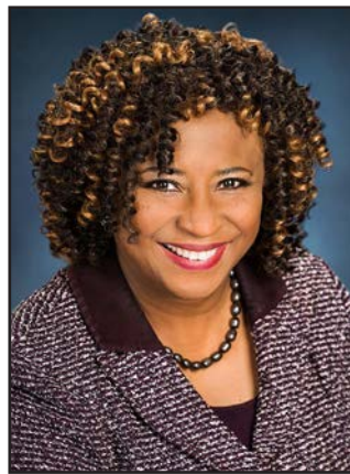
District Attorney Pamela Price

"This unit and its work are the start of the reckoning Alameda County has asked for holding people accountable