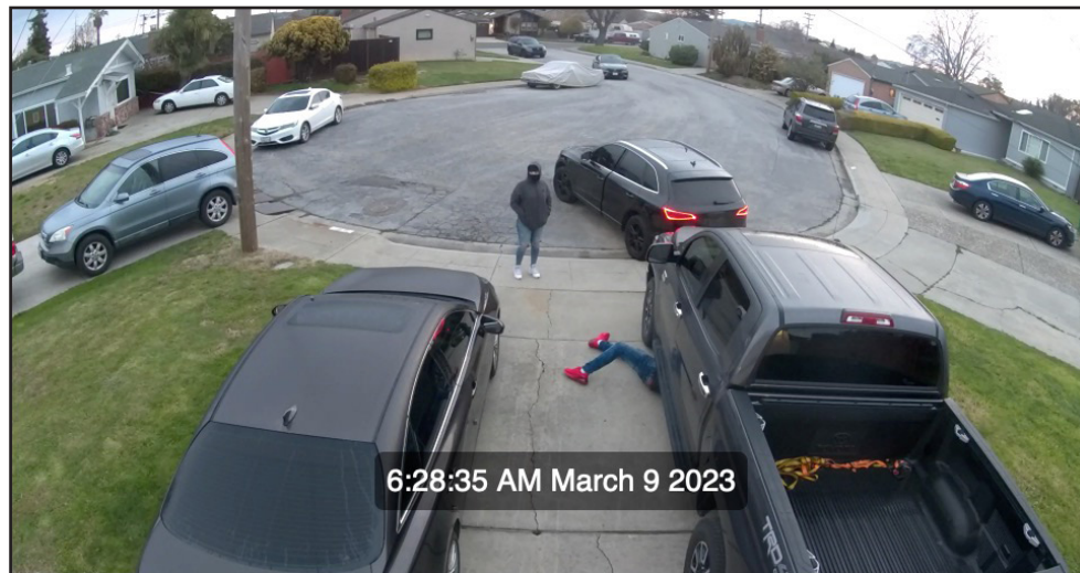
A female accomplice appears to stand as a lookout while the male suspect cuts off the vehicle's catalytic converter with a portabel electric saw in an image from a video from Bruce Calderon's security camera.

Before leaving for the trip, Calderon said he took all the