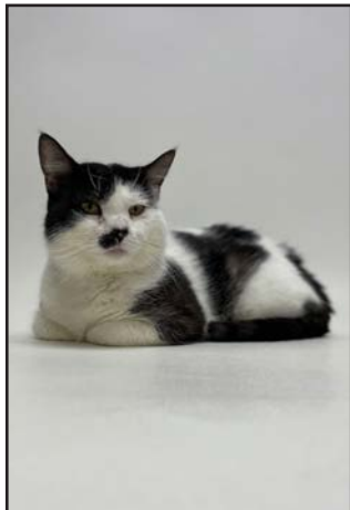
Chavo Del Ocho