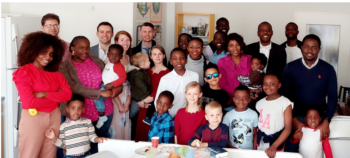
Above: Church congregation at Stuttgart

The little flock that attends the weekly Bible study is eager to serve the Lord. They faithfully go out soulwinning and it becomes clear that we must move to Stuttgart to care for it and the young believers. We are now looking for suitable housing. We may also soon need to rent a building for our meetings. Left, a special day with attendants of the Bible study. Brethren, pray for us.