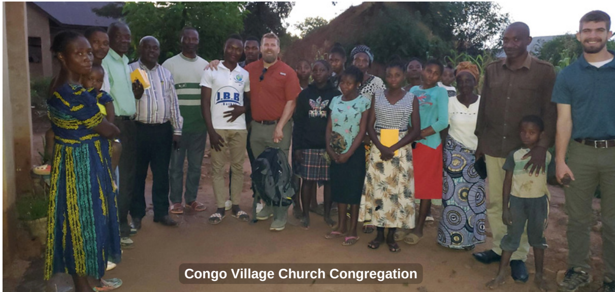
Congo Village Church Congregation

God has been so good as we have traveled around the U.S. to many churches. We have been so blessed by the people of God and the care they have shown our family as well as their hearts of help and sacrifice to get the gospel around the world. Thank you for continuing to partner with us for the cause of Christ!