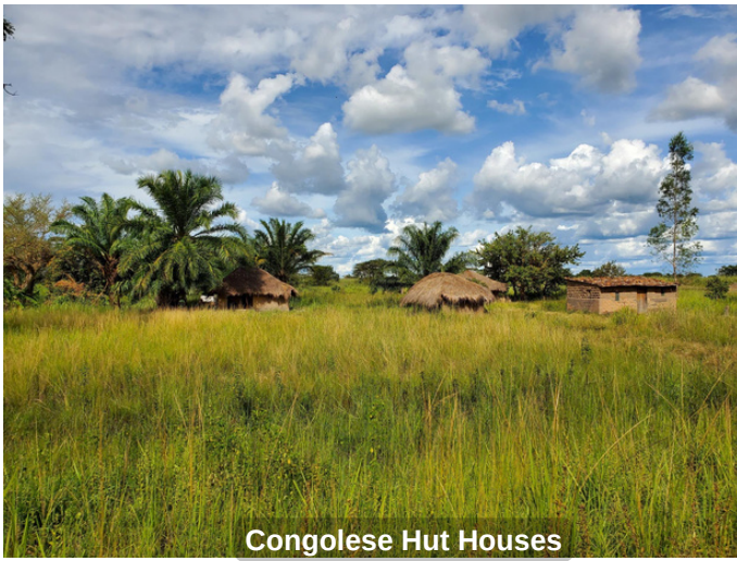
Congolese Hut Houses