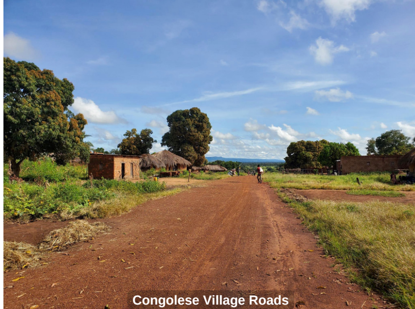
Congolese Village Roads

You may remember that on our first trip we met a Congolese man who had a vision for reaching a particular area in the interior. We also had been praying for a long time for an open door to the unreached and were so excited by this newly found contact. Since then, we have continued to pray for these unreached and for a door to reach them. I had been in touch with our contacts in the weeks leading up to our second trip and things seemed to be coming together smoothly for a trip into the interior region to which we hoped to go; however, upon arrival, I was informed that Rebel groups had been in that general area in each of the two months preceding our trip. Of course, caution needed to be exercised, yet, I was sure God had placed this trip on my heart for a reason so we gathered, prayed, and asked God to order our steps in His Word that we might know whether to proceed and how.