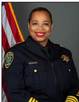
Chief Angela Averiett

Part of that public safety strategy is to put more cops on the streets as soon as possible.