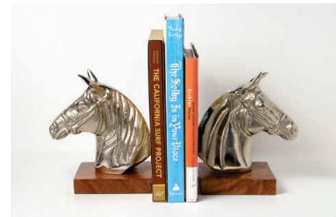
HORSE BOOKENDS $120 Dennee's Distinctive Furniture, 310-540-0437