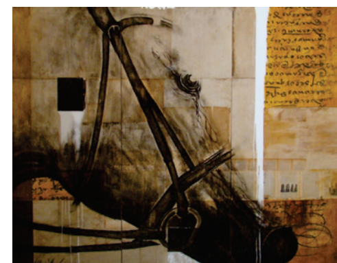
"1948" BY ASHLEY COLLINS $155,000 96"x120" mixed media art, diehlgallery.com