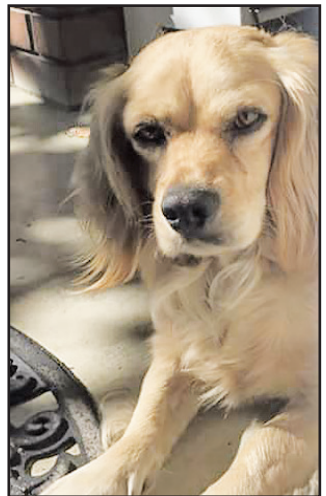
The age of this lost dog is estimated to be 18 months.

This young golden Cocker Spaniel was recently found in the Cherrywood Development off Alvarado Street in San Leandro near Accolade and Jubilee streets. He is currently at Tri-City Animal Shelter, 1950 Stevenson Blvd., in Fremont. If you are the owner or have any information about this animal, call Tri-City Animal Shelter at 510-790-6630 and reference the animal ID number A148325.