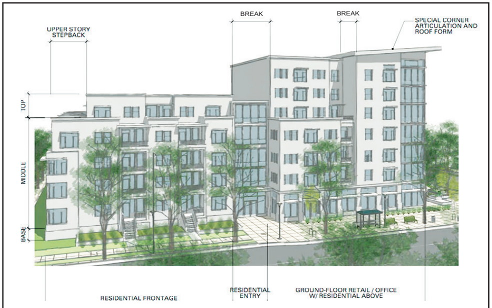
The City of San Leandro recently revealed possible plans for the redevelopment of the Bayfair Mall site.

and water pumps. What about water? Waste water in the area is handled by the Oro Loma Sanitary District and they have told the planners that they have sufficient capacity for growth from new developments. And, the East Bay Municipal Utility District says their water mains have enough capacity to serve potential new residents, but some infrastructure may need to be replaced due to aging pipes. The next major step for the Bay Fair TOD plan is for the City Council to review the draft at a meeting in January or February. The entire plan can be found on the city's website, www.sanleandro.org under the community development tab.