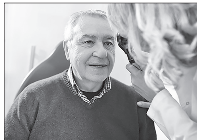
It's wise to have a professional check your eyes regularly.

medical eye exams, often at no out-of-pocket cost, to eligible people through a network of approximately 6,000 volunteer ophthalmologists. Nearly 2 million people have been helped through EyeCare America's two programs.