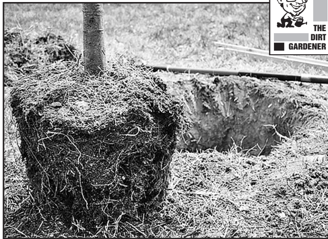
When transplanting trees, make sure not to completely bury the root ball.

The planting holes should be twice as wide and eight inches deeper than the root ball. Also, dig the new planting holes ahead of time.