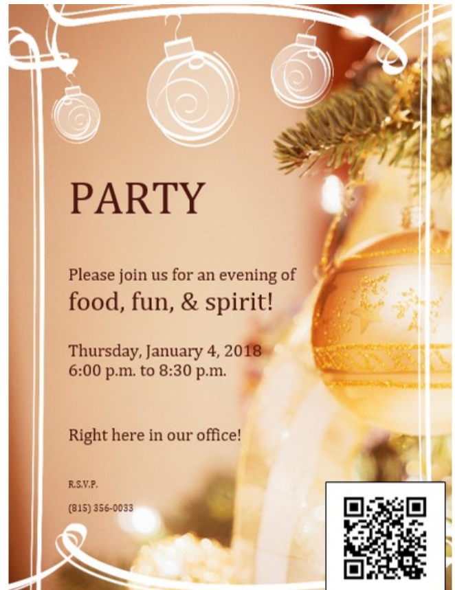
New Year Party Invite