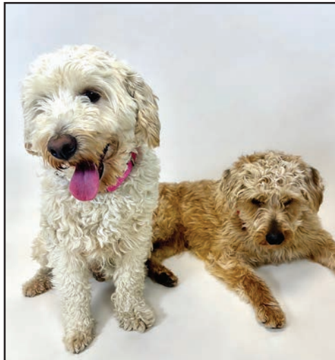
Benny and Lenny

Copper is a 2-year-old dachshund mix. He's a skinny boy dealing with a poor start at life. Copper seeks attention and enjoys