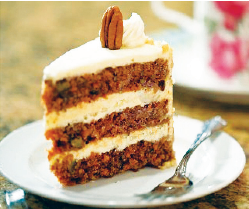
Old-fashioned Carrot Cake with cream-cheese frosting