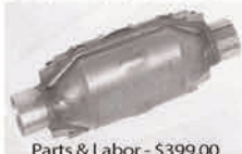
Parts & Labor - $399.00

CATALYTIC CONVERTER THEFT IS ON THE RISE! A tough-to-cut barrier & theft deterrent to protect your catalytic converter. Protect it before it's too late!