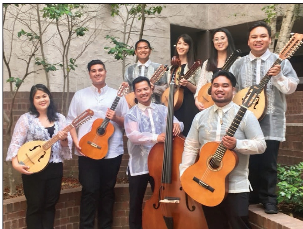
The American Center of Philippine Arts will perform a free concert.

For more information, visit sanleandro.org/winterreading or stop by a branch location (Main Library at 300 Estudillo Ave., or Manor Branch Library at 1241 Manor Blvd).