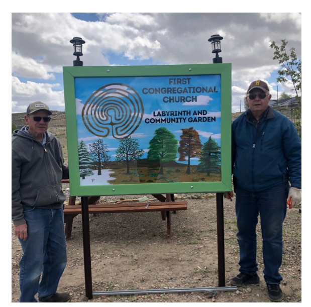
Stop by and check out our new sign for the Labyrinth & Community Garden. It is beautiful!