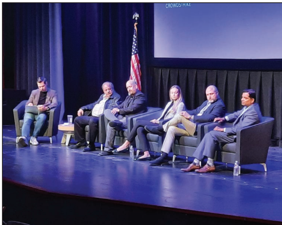
Congressman Eric Swalwell, left, moderates a discussion about cybersecurity on how small businesses can protect themselves.