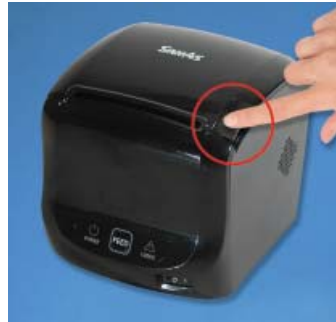
Designed for Jam-Free Operation