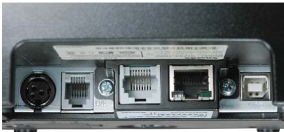
Triple Interface Standard

Distinctive in its small size the Giant 100 has the features and speed of much larger 3" printers.