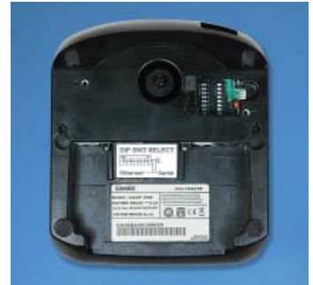
Easy Access to Dip-Switches / Tool-Free Access Optimizes Serviceability