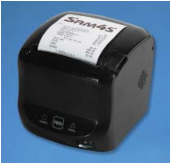
The Giant 100 Accommodates Up to 3" Wide Thermal Receipt Paper