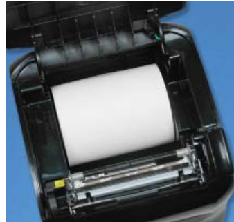
Drop and Print Paper Loading – Optional Paper Width Selector Allows 58mm Wide Paper Rolls