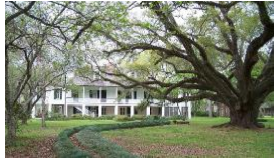
The Melrose Plantation

MINIMUM # PASSENGERS REQUIRED: 30 people