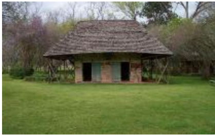
The African House Slave Fort