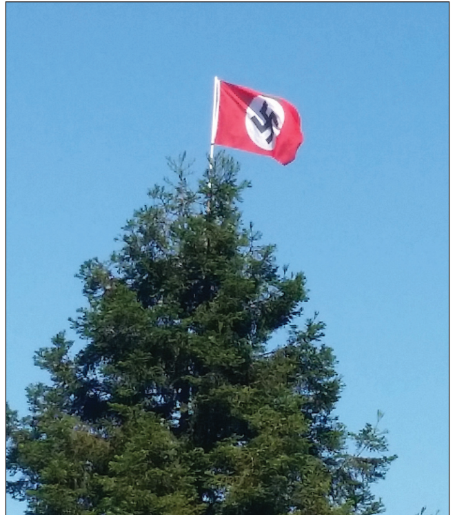
One neighbor says he is consid- The swastika is flown on a pole on top of large tree and is ering buying a firearm to protect visible from the Center Street, just about a block away from

see FLAG on page 11 Creekside Middle School.