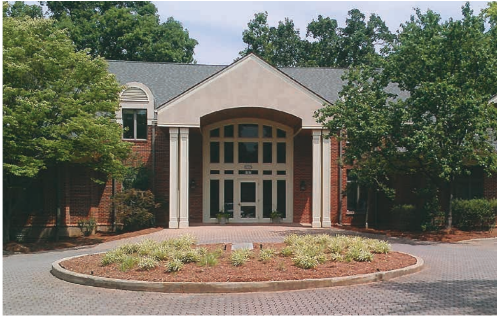
Triangle Arthritis & Rheumatology Associates' new office building in Raleigh.

Calling all you Facebook users! If you would like to follow us, please take the time to become a fan of Spectra Builders.