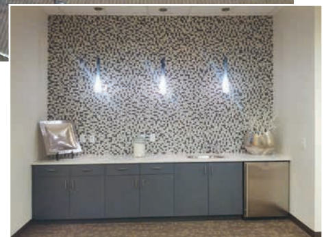
The conference room serving area with its glass tile backsplash.

Spectra added offices, a break room, and a conference/board room featuring glass wall tiles, bamboo flooring and other high-end finishes throughout. This project was completed for Clinipace through Duke Realty, one of the largest commercial real estate companies in the United States.