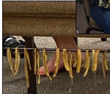
Gayle drying banana peels to make cordage.