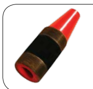
DETAIL: The Mud Gun Discharge Nozzle.