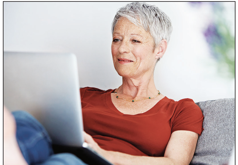
Don't be afraid to make the first move when searching online for a new companion.

Make an effort: A lot of times, people — especially women — sit back and let others come to them. Don't be afraid to make the first move. When you find someone you like, send