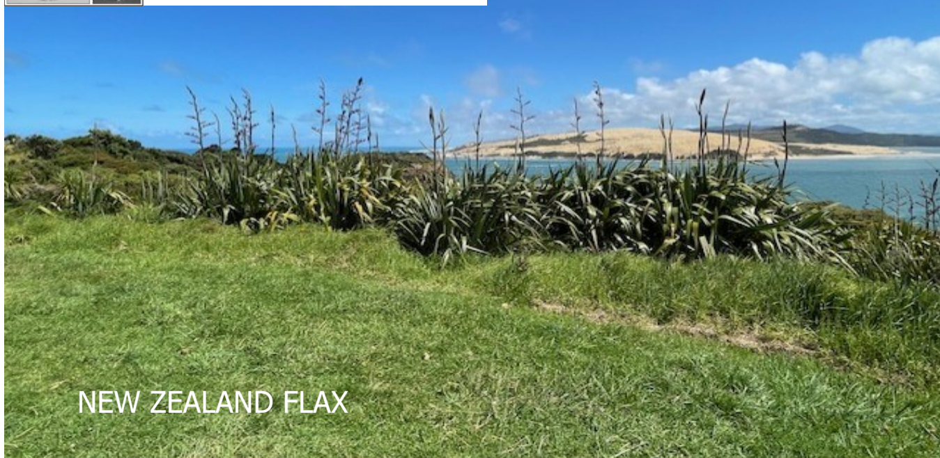
NEW ZEALAND FLAX

Great Basin Basketmakers PMB 293 8175 S. Virginia St. #850 Reno, NV 89511