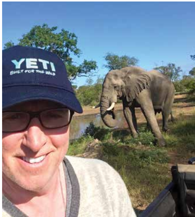
Africa at Its Best – Up Close & Personal!

world is very congenial with an almost family atmosphere. The industry is small with around 40-50 molders in the South African region but growing due to an unprecedented drought which has been on-going for the last three years. The effect has placed restrictions on usage to just 50 litres/day (13 US gallons) which has driven a huge demand for water tanks. The situation is reminiscent of the Australian boom and bust in the late 00s but without government incentives for