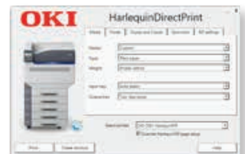
Harlequin MultiRIP 10