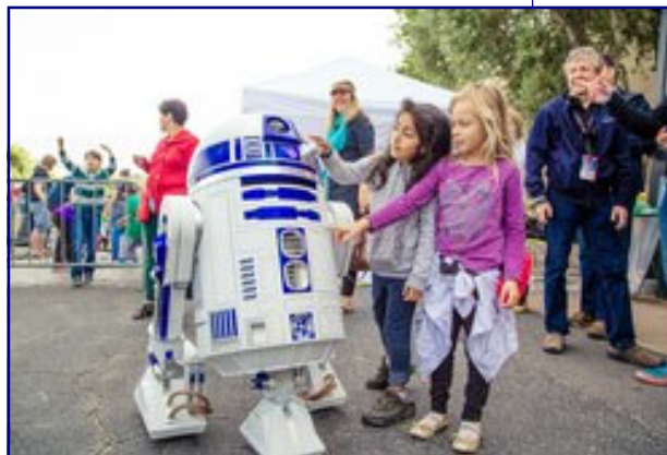
The Bay Area Maker Faire attracted youngsters and adults in 2016.

break through is the ability to compare systems in real time, and all over the