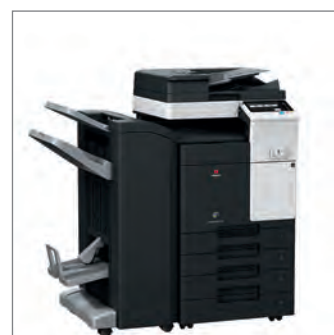
The d-Color MF283 equipped with a DF-628 Document Feeder, FS-534SD Finisher and PC-214 Trays