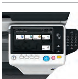
New 7" Touch Panel with NFC authentication area and optional KP-101 numeric keypad