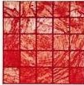
Slate Tile Grouted 15x15 cm