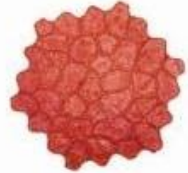
River Rock 105x105 cm