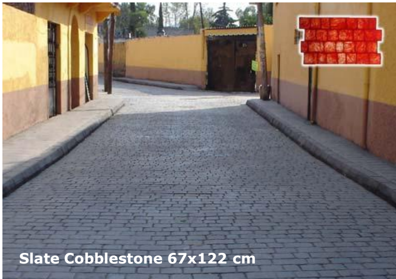
Slate Cobblestone 67x122 cm