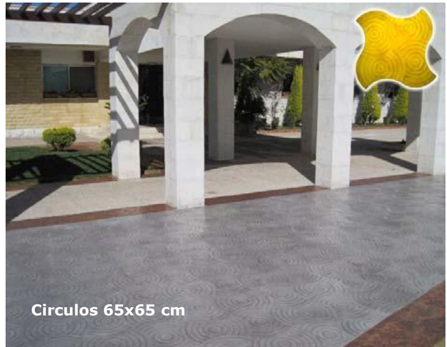
Circulos 65x65 cm