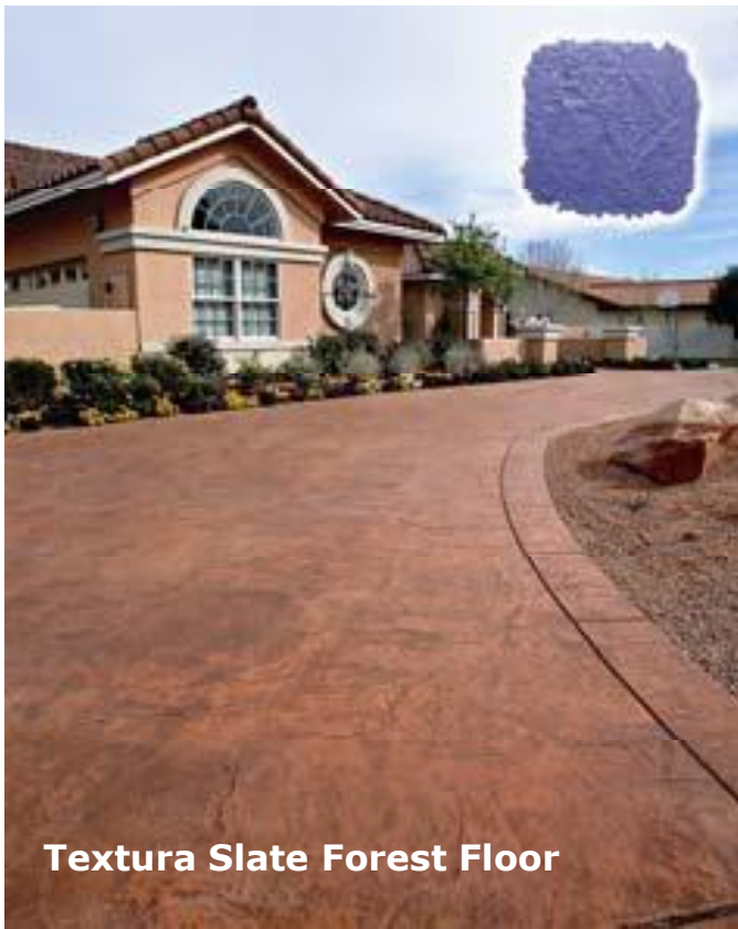
Textura Slate Forest Floor