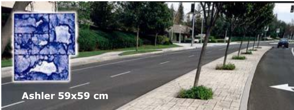
Ashlar 59x59 cm