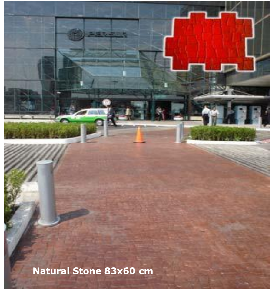
Natural Stone 83x60 cm