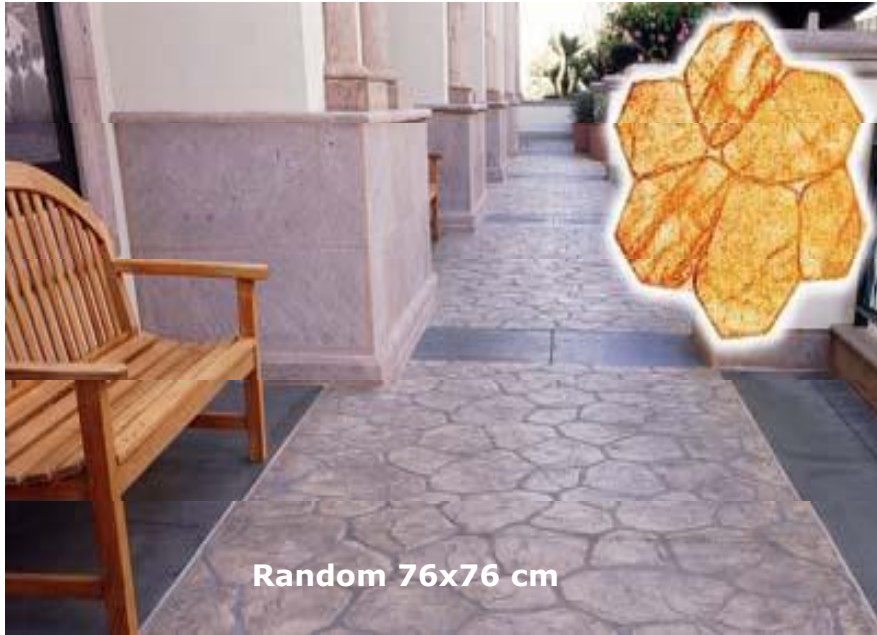
Random 76x76 cm