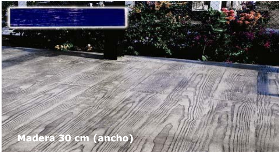
Madera 30 cm (ancho)