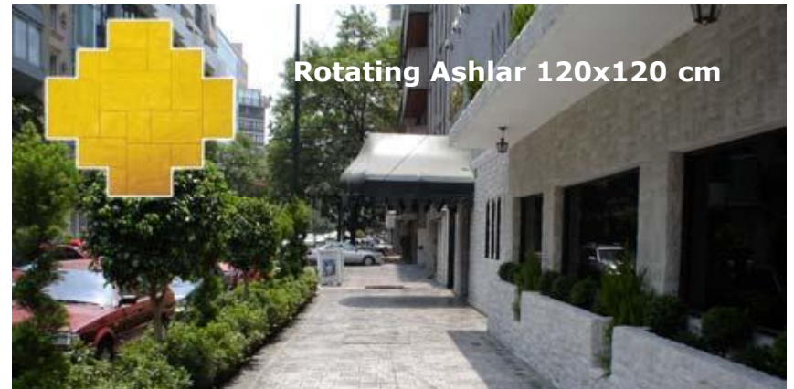
Rotating Ashlar 120x120 cm