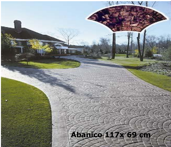
Abanico 117x 69 cm