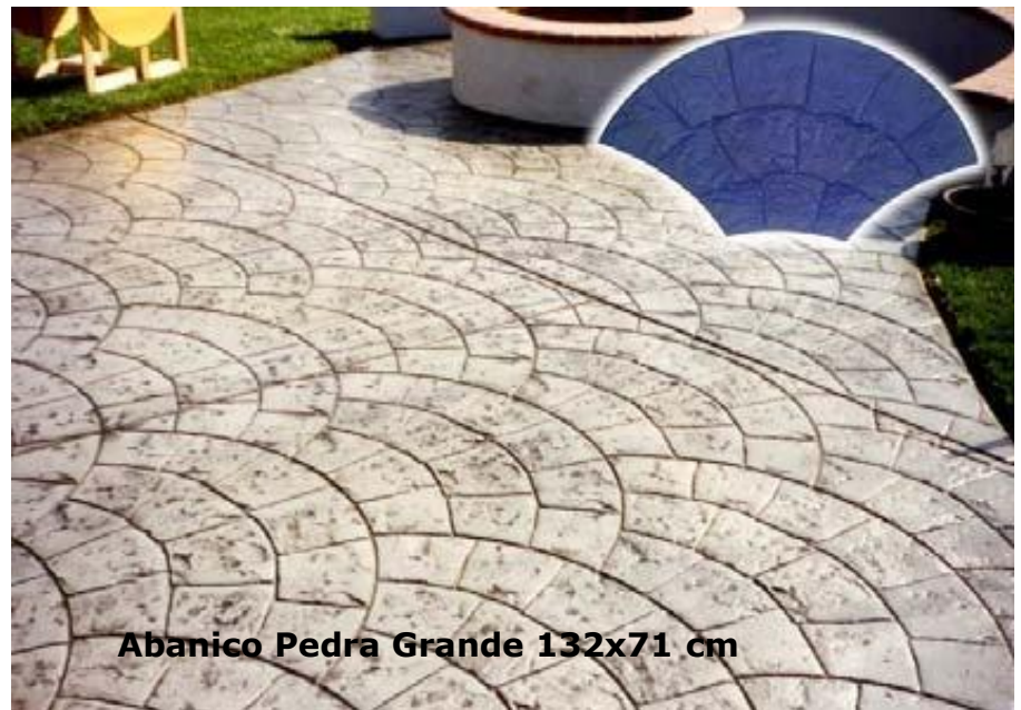
Abanico Pedra Grande 132x71 cm