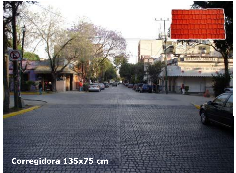
Corregidora 135x75 cm