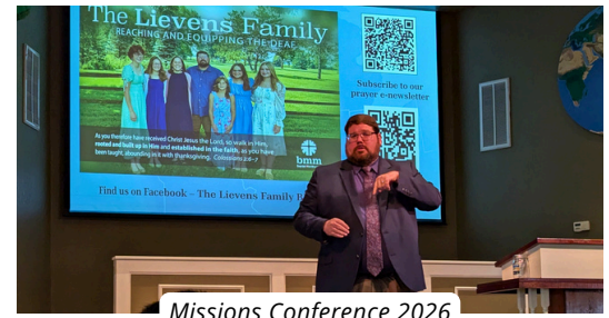
Missions Conference 2026