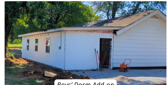
Boys' Dorm Add-on