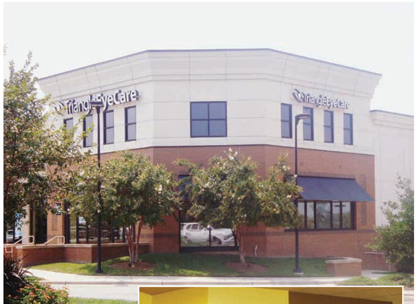
Triangle Eye Care’s new state-of-the-art facility.

Pictured at right: The display area is colorful, comfortable, inviting and offers a wide selection of eyewear.