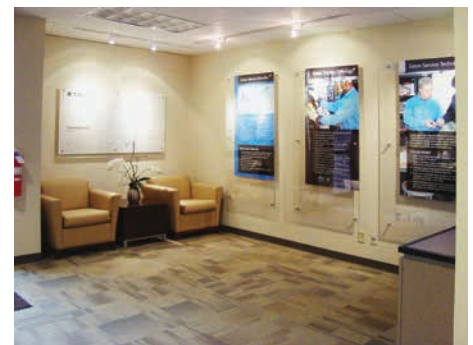
A look at the customer waiting area at the Eaton training center.

Employees working in the building on a daily basis, as well as the students that visit the facility, are delighted with the refurbished facility and are enjoying spending time there.