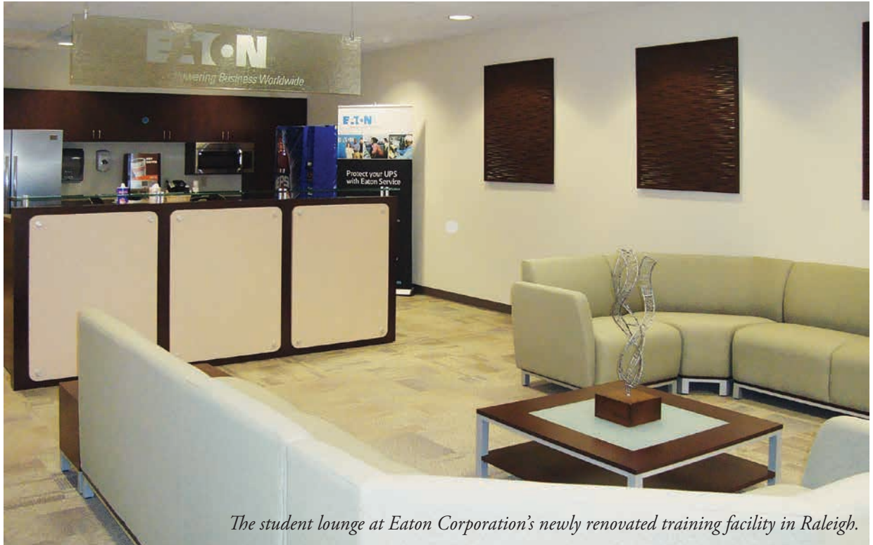
The student lounge at Eaton Corporation's newly renovated training facility in Raleigh.